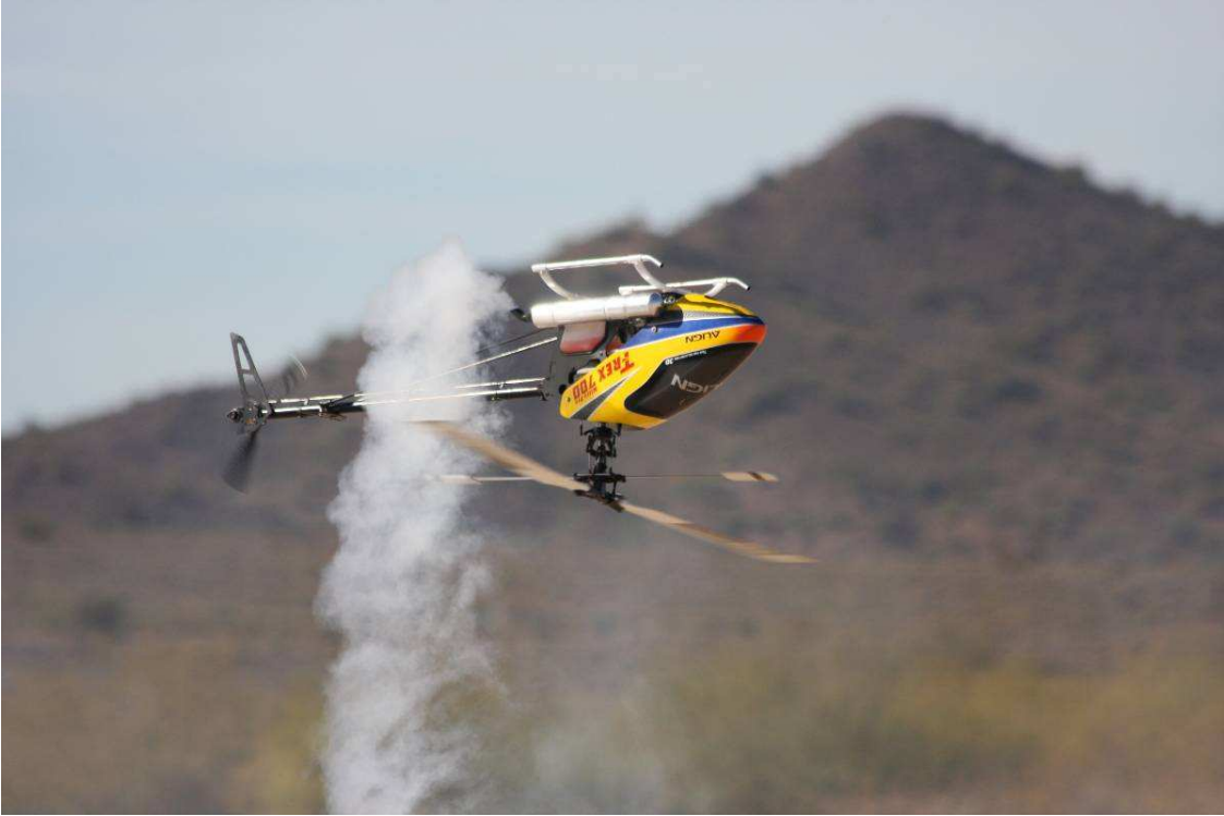
Rotor Wash 10