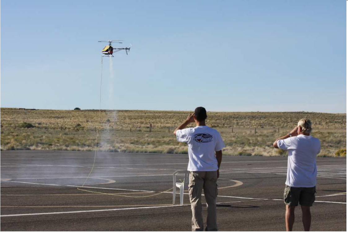
Rotor Wash 6