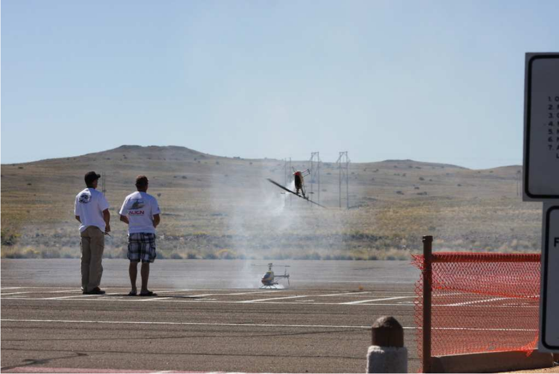
Rotor Wash 11